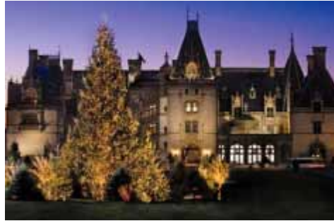
Biltmore Estate at Christmas.

A wonderful holiday trip to the North Carolina mountains is planned for December 4-5. Upon arrival in Asheville on Friday, enjoy a docent-led tour of the Asheville Art Museum followed by lunch at the French bistro Bouchon. Afternoon highlights include a visit to the art gallery 16 Patton, featuring the colorful and whimsical work of Signe and Genne Grushovenko; shopping in downtown Asheville; and an optional Candlelight Tour at the Biltmore Estate. Accommodations will be at the Doubletree Hotel located across from historic Biltmore Village, which features lovely shops and restaurants decorated for the holidays.