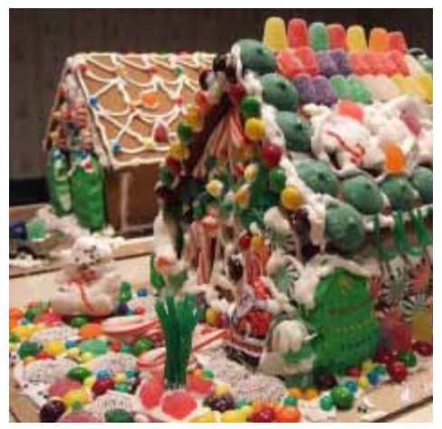
Holiday Gingerbread Houses at the Grove Park Inn.

On Saturday, enjoy the annual Christmas Craft and Greenery Sale organized by the French Broad River Garden Club, featuring handmade items made by area artisans. Then travel to the Grove Park Inn for lunch at the Grovewood Café and additional shopping at the Grovewood Gallery, which offer an extensive collection of traditional fine American craft. You will also have time to marvel at the Grove Park Inn's nationally-recognized collection of holiday gingerbread houses.