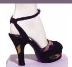
The Heights of Fashion: Platform Shoes Then and Now MMA Through May 30, 2011