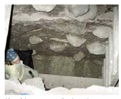
View of the capstones sealing the tomb.

Left: Dorie filling the sample hole in the base of a vessel found inside the tomb.