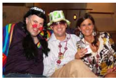
Guests at the 2008 Warhol Factory Party.

tickets, visit www.mintmuseum.org or contact Betsy Gantt at 704/337-2029 or betsy.gantt@mintmuseum.org.